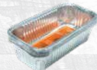
TIMBERLINE GREASE PAN LINER - 5 PACK SKU: BAC404