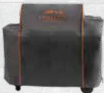
FULL LENGTH GRILL COVER - TIMBERLINE 1300 SKU: BAC360