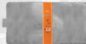
DRIP TRAY LINER 5 PACK - TIMBERLINE 1300 SKU: BAC515